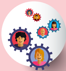
Making the Right Match