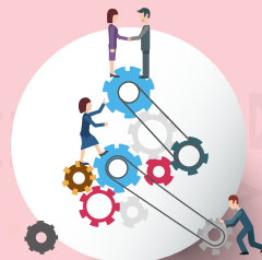
Business Matchmaking Team Assistance