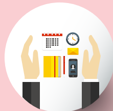
Real-time Tracking Diary