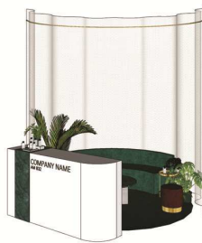
2019- 6sqm Booth