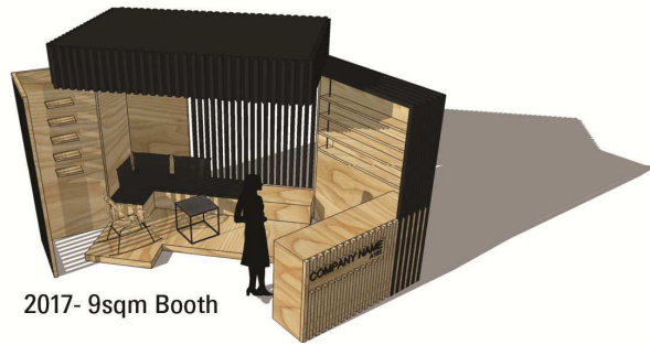
2017- 9sqm Booth