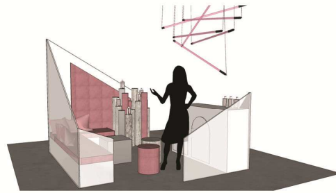
2018- 9sqm Booth