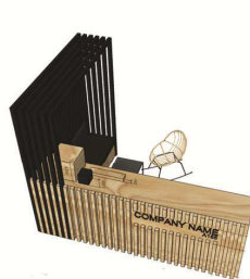
2017- 6sqm Booth