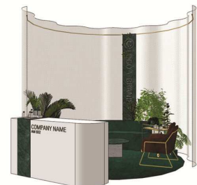
2019- 9sqm Booth

We accept the Exhibition Terms and Conditions of Participation, the Technical Guidelines and Price Lists of Messe Frankfurt Middle East GmbH and their partners and wish to register for Beautyworld Middle East 2021.