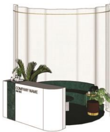
2019- 6sqm Booth