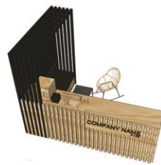
2017- 6sqm Booth