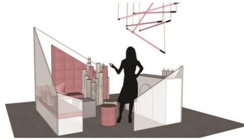
2018- 9sqm Booth