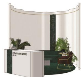
2019- 9sqm Booth

We accept the Exhibition Terms and Conditions of Participation, the Technical Guidelines and Price Lists of Messe Frankfurt Middle East GmbH and their partners and wish to register for Beautyworld Middle East 2020.