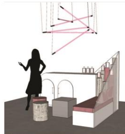
2018- 6sqm Booth